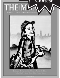
2009 cover artwork by contest winner Madeline Moe